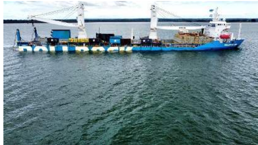
OTAMA on her way to the breakers

As most would be aware, the former Oberon Class submarine HMAS OTAMA had been languishing in Westernport Victoria for many years. Earlier this year a decision was made to finally scrap the former cold war warrior and she was transported to Henderson shipyard in Western Australia via the heavy lift ship MV ROLLDOCK SUN. The process of dismantling OTAMA commenced. FHSM made application to salvage certain elements of OTAMA for use in exhibits at the Holbrook Submarine Museum. Regrettably this was initially refused by the Federal Department of Defence, however a repechage was undertaken by FHSM to the Federal Defence Minister and subsequently FHSM was granted permission to remove certain items. These were duly removed, packaged up and sent to Holbrook. Many of these items tell important stories as part of Australian Naval history and, in time will be incorporated into museum displays.