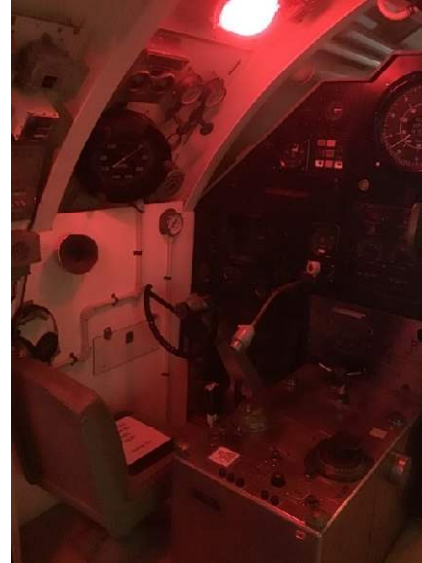
Updated OMC with the newly inserted ex-Otama lower voice pipe

We are still awaiting 10 Mile Engineering for the OOW Panel and some repair to the Duck's Arse of Otway.