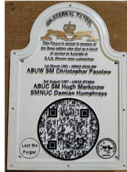
The completed 3d Printed Memorial plaque - The QR code provides more detailed