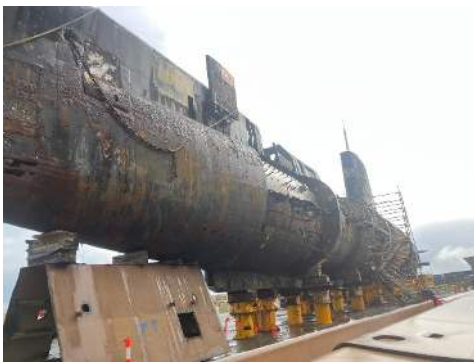
OTAMA being slowly dismantled at Henderson Shipyard in WA.

We are grateful to all those who have assisted in procuring these important items. As can be seen from the images included here, OTAMA is now only a fond memory to those who served on her. However, a small part of this important chapter of Australian Submarine history will be preserved at the Western Australian Maritime Museum, The Australian War Memorial and thankfully - the Holbrook Submarine Museum.