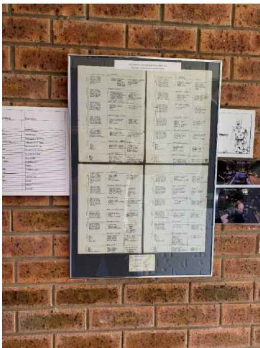
Updates to the Oberang room.