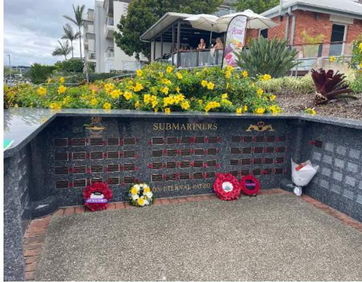
Wreaths and poppies placed at Submariner's Honour Wall