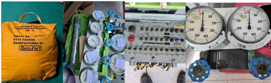
A sample of some of the items saved from the scrap heap which will now be displayed at the museum.

Some of the items that will soon form part of the Museum exhibits are shown below.