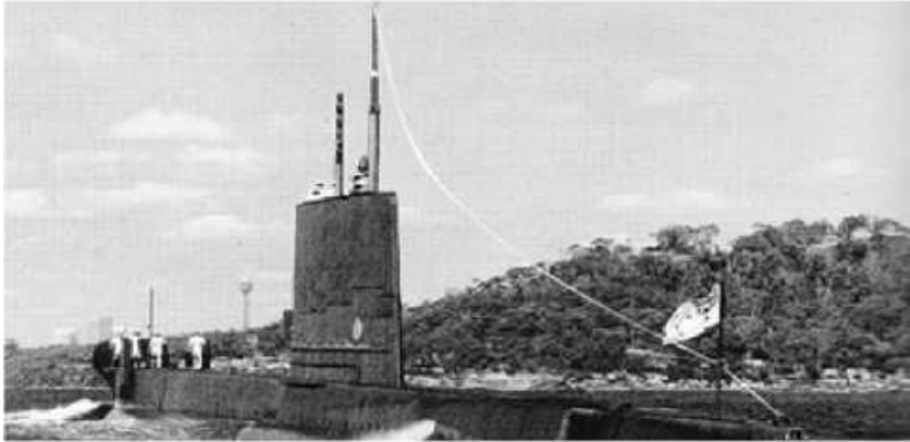
HMAS OTWAY flying her paying off pennant. (flown on the last entry before paying off Decommissioning - 17 th February 1994