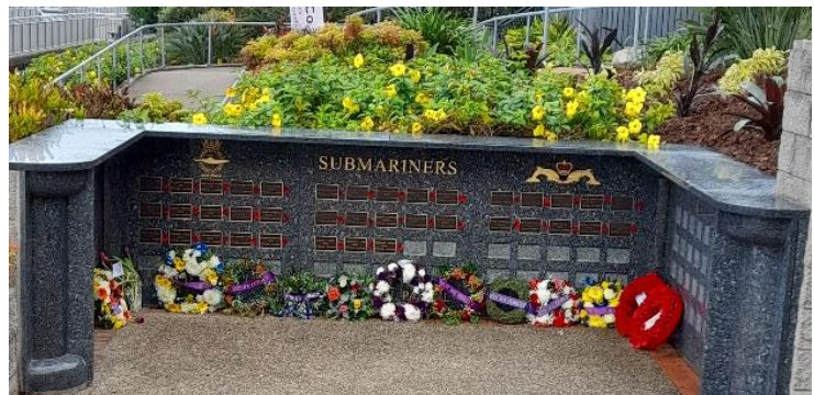
Thirty eight plaques on the Memorial Wall were not forgotten as poppies were added to their plaques