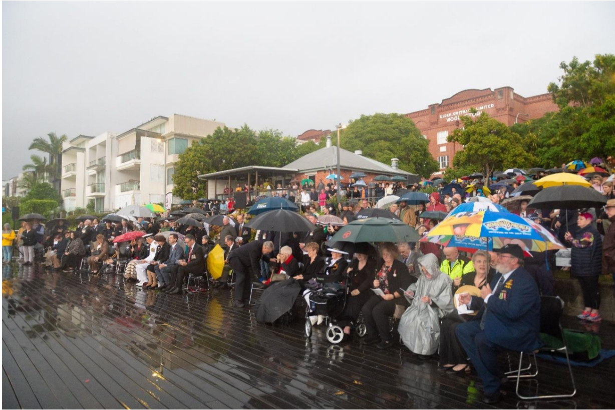
Some of the 2000+ who attended the Dawn Service at the Submarine Walk Heritage Trail, Brisbane